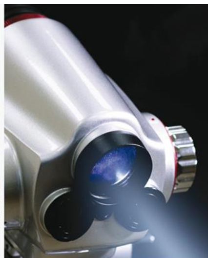
Lighting 25000 LUX