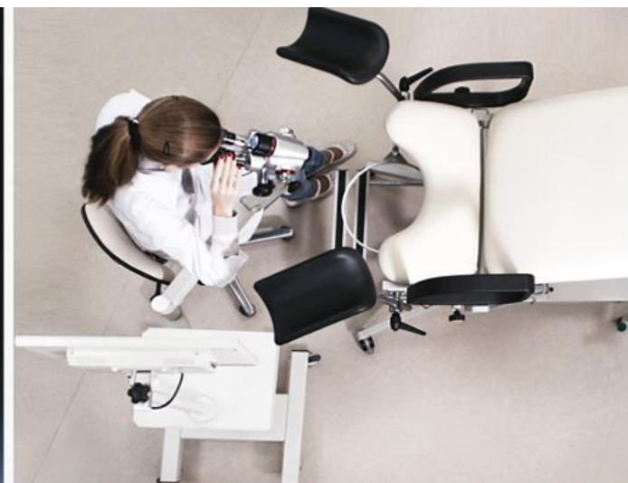
Compatible with all types of gynecological chairs