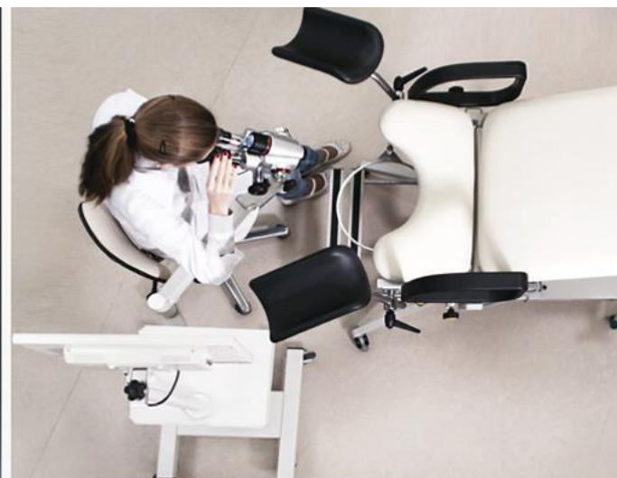
Compatible with all types of gynecological chairs